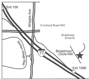
Fairfield Inn & Suites. Staying is Believing."

1-77 Southbound, Exit 109. Left at traffic signal (Everhard). Turn right on Stratmoor to Broadmoor Circle.